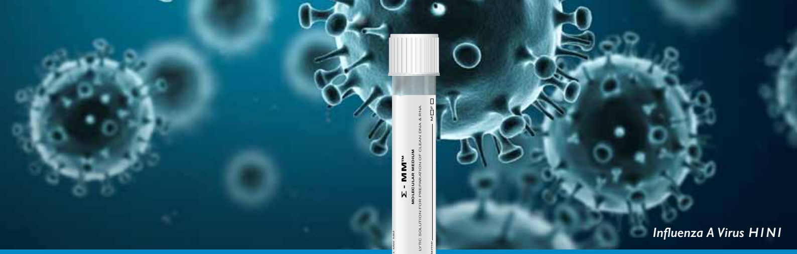
Influenza A Virus H1N1